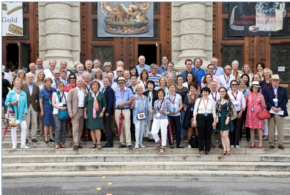
The Hénokiens: 2017 Annual Conference, Vienna, 23 June 2017