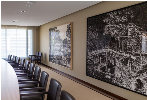
It is in this room that the Partners meet every week to discuss current matters.

The link to the extended Pictet family is closer than might be expected, given the formal distance. According to Renaud de Planta, there’s no shortage of suitable offspring waiting in the wings. In this respect, the family may be considered to have privileged access, making